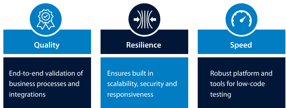
Figure 2: Key Elements of low-code test strategy